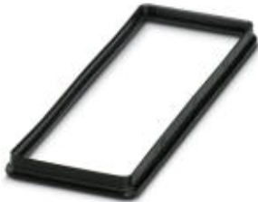
Profile gasket for sleeve housing type B24.....EEE

Please be informed that the data shown in this PDF Document is generated from our Online Catalog. Please find the complete data in the user's documentation. Our General Terms of Use for Downloads are valid ( http://phoenixcontact.com/download )