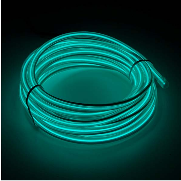
Bendable EL Wire - Blue-Green 3m