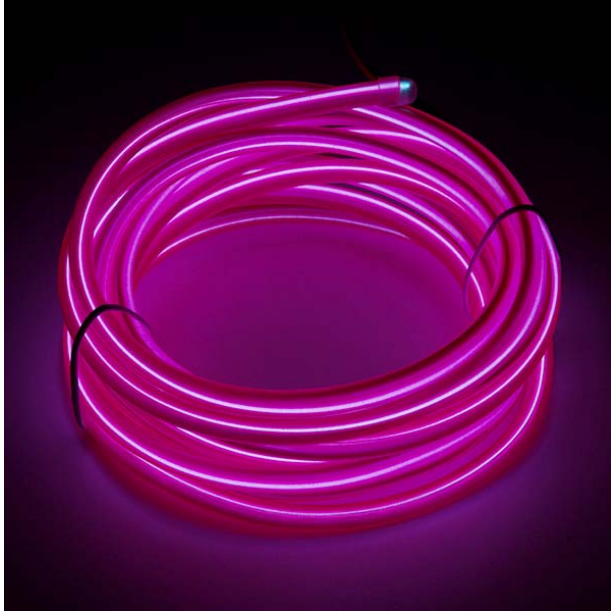
Bendable EL Wire - Pink 3m