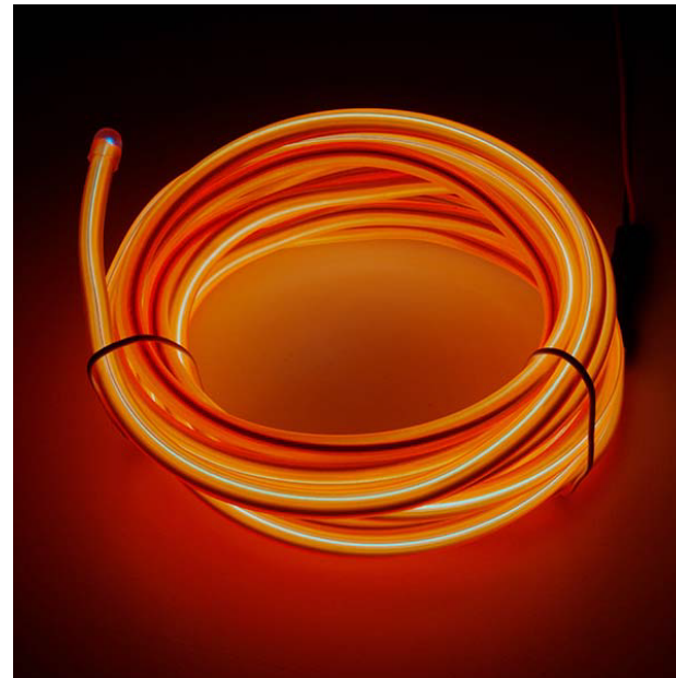
Bendable EL Wire - Orange 3m