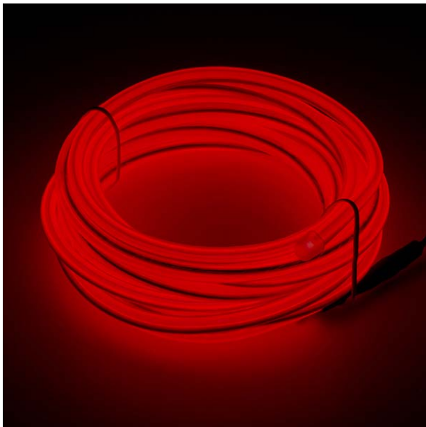
Bendable EL Wire - Red 3m