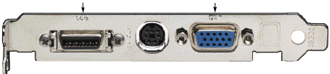
15 pos. Analog VGA to CRT Monitor